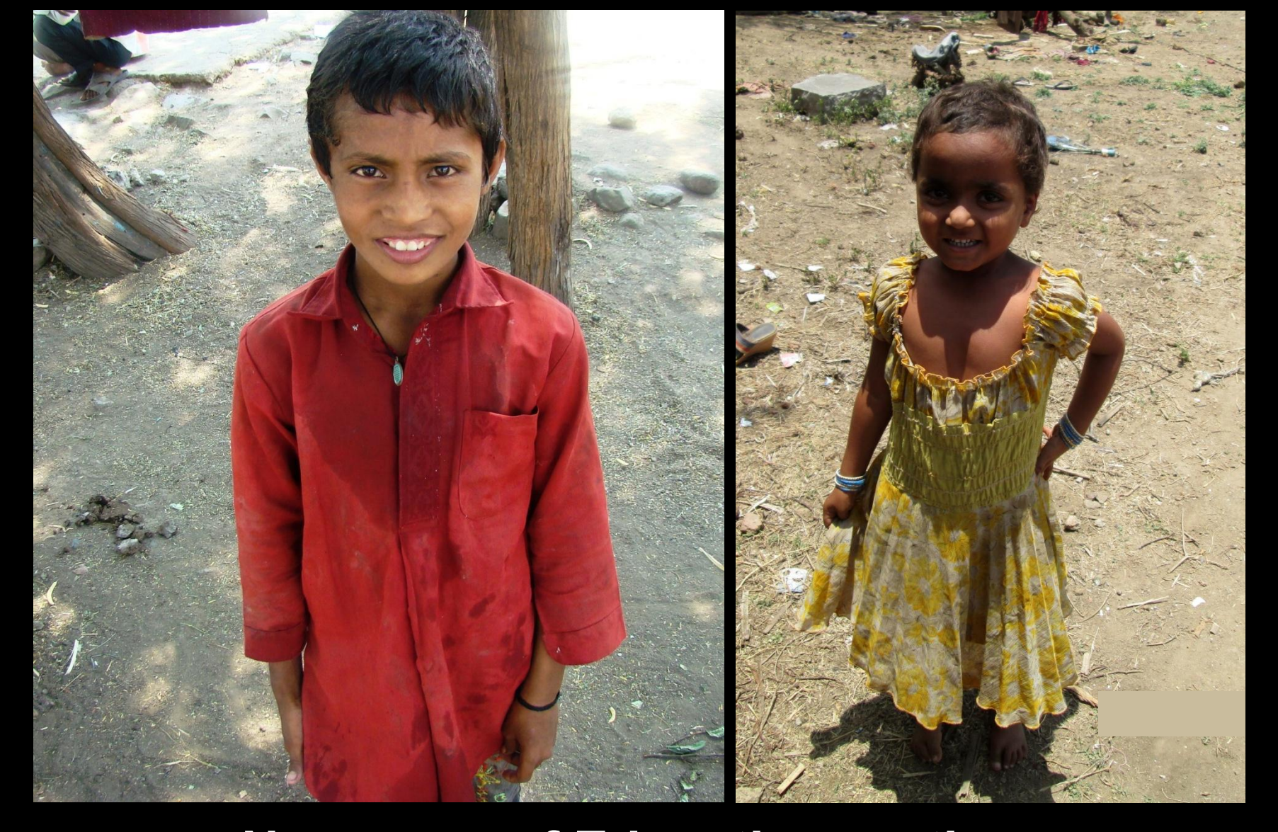
No means of Education..... thus Seek Alms, Rag Picking, Wage Labour