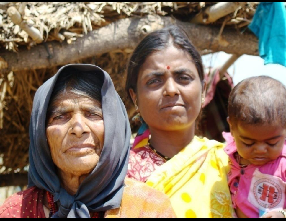
Lack Access to Healthcare and Maternity Care Services..